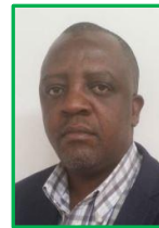
Immediate Past Chair