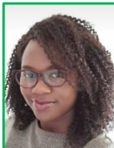
Universities Lectureres' Representative