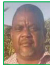
College Lecturers' Representative