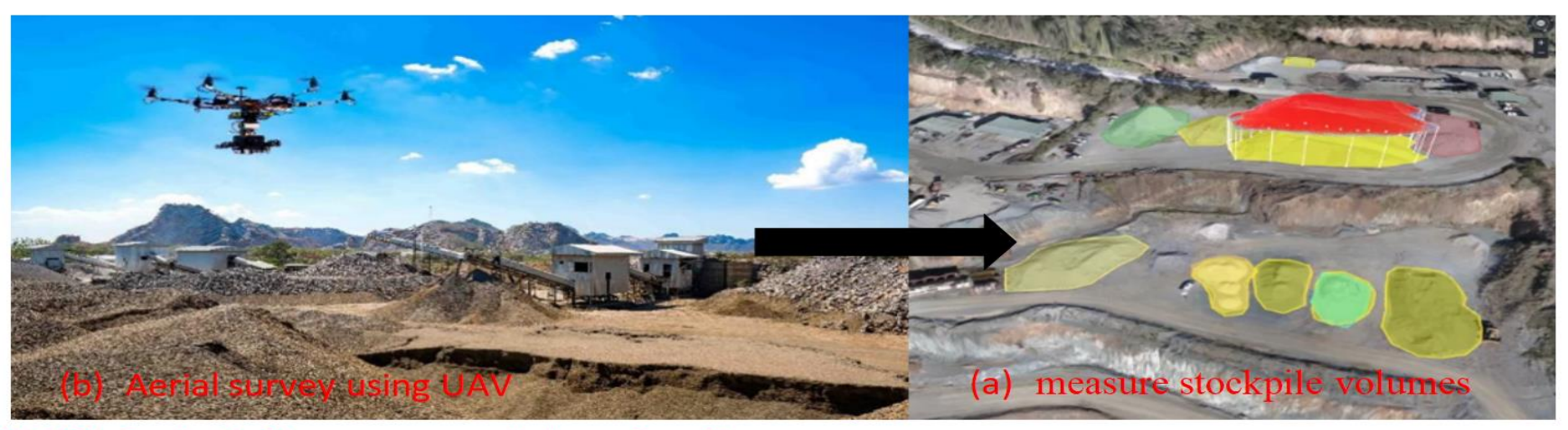
<u>UAVs</u> in stockpile management at a mine site.